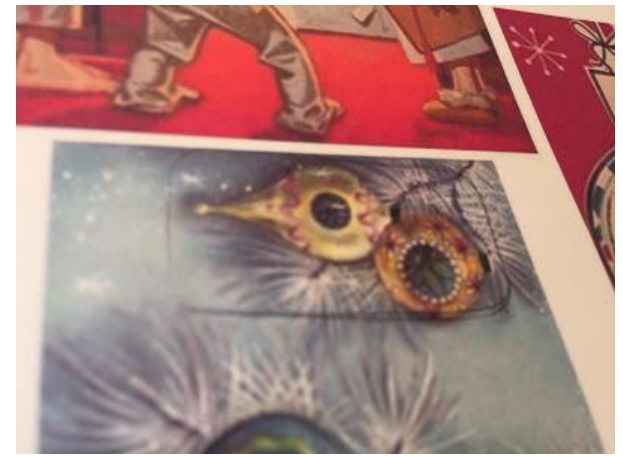
(Trace around your shape for the image to cut out.)

Gel medium works well to adhere your image to the blank.