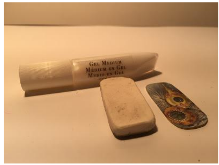
(This mini set of mediums is a great way to sample a product or include in an artistic gift set.)

Gel medium works well to adhere your image to the blank.