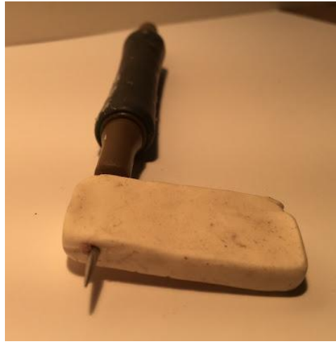
Next step is to choose the perfect Vintage Christmas image.

I liked the idea of a domino shaped pendant that was lightweight. I used my "pokey-tool" to push a hole through the domino shape.